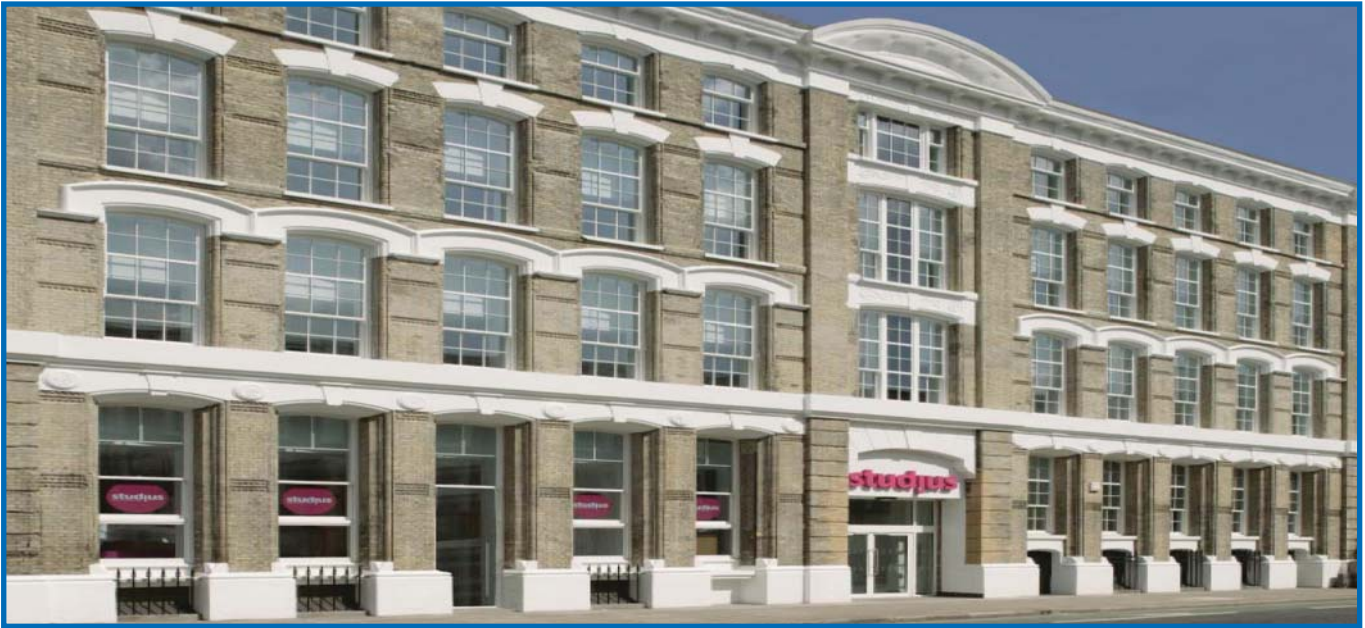
Liberty House, London - Brandaux's latest acquisition, located adjacent to the main City University campus.