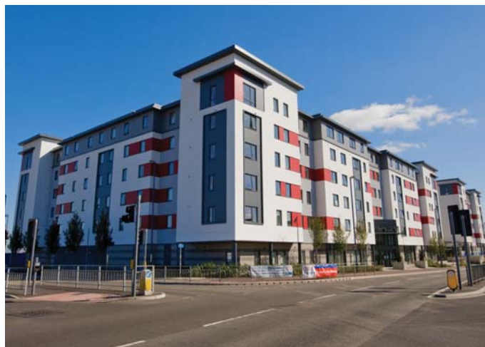
Liberty Quays, University of Kent †.

† Liberty Living is the exclusive brand for the Brandeaux student accommodation portfolio.