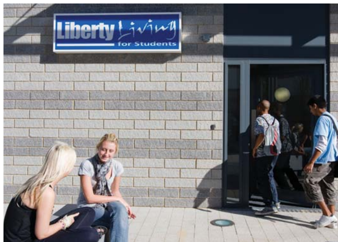
University of Kent students at a Brandeaux 'Liberty Living' residence †.

† Liberty Living is the exclusive brand for the Brandeaux student accommodation portfolio.