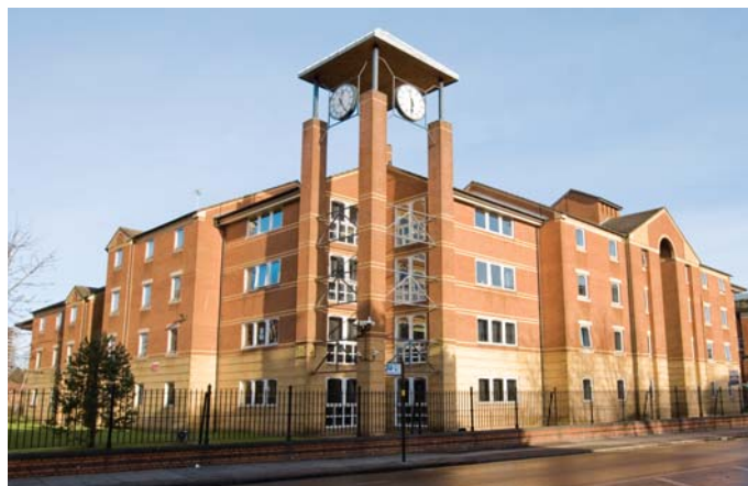
Liberty Queen's Hospital Close, Birmingham, 337 beds, a residence within the Brandeaux student accommodation portfolio.