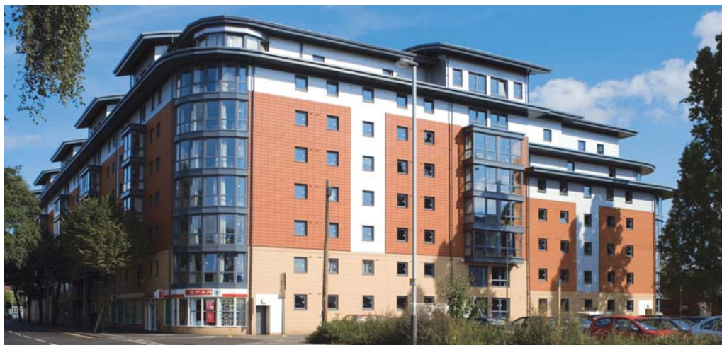
Liberty Park, Leicester, 563 beds, a residence within the Brandeaux student accommodation portfolio.

The target return for Brandeaux Student Accommodation Fund (US Dollar) is 5% to 7% to allow for the cost of currency hedging.