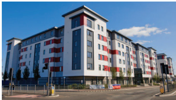
Liberty Quays, University of Kent.