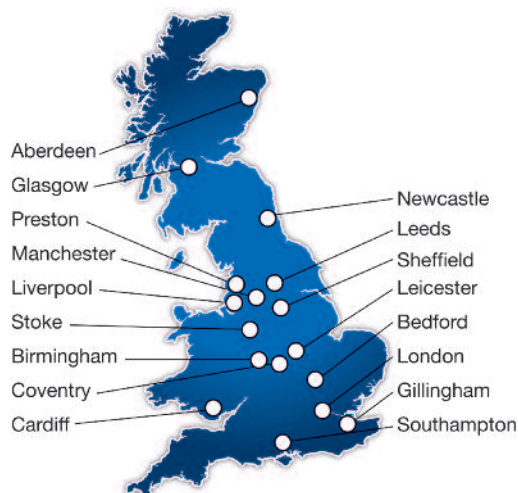
Brandeaux's student accommodation locations.

A minimum subscription level is applicable ONLY to the institutional platform through which the subscription of the investing client is made. Brokers, therefore, do not have to regard Brandeaux Student Accommodation Fund (Sterling)'s minimum subscription requirement as a barrier but should refer to the terms of the institutional platform product. Full details of the terms of subscription and redemption of shares in Brandeaux Student Accommodation Fund (Sterling) are set out in the Private Placement Memorandum.