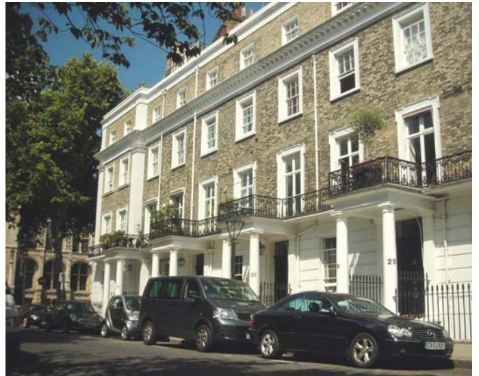
A typical ground rent investment within the Fund's portfolio with significant reversionary value.