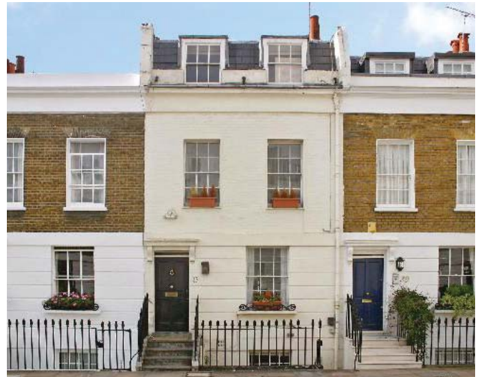
A typical ground rent investment within the Fund's portfolio with significant reversionary value.