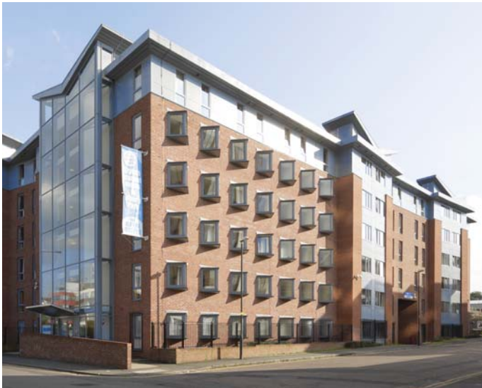
Liberty Park, Coventry, 464 beds, a typical student residence within the Fund's portfolio.