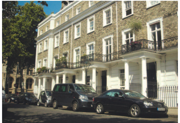
A typical ground rent investment within the Fund's portfolio with significant reversionary value.

A minimum subscription level is applicable ONLY to the institutional platform through which the subscription of the investing client is made. Brokers, therefore, do not have to regard Brandeaux Dual Asset Fund (Euro)'s minimum subscription requirement as a barrier but should refer to the terms of the institutional platform product. Full details of the terms of subscription and redemption of shares in Brandeaux Dual Asset Fund (Euro) are set out in the Private Placement Memorandum.