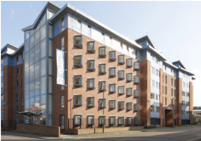
Liberty Park, Coventry, 464 beds, a typical student residence within the Fund's portfolio, which is marketed to students under the Liberty Living brand.